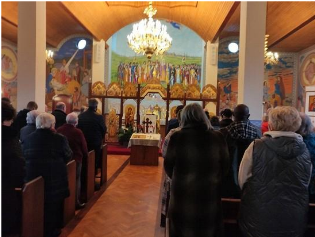
IFW members at the Service: